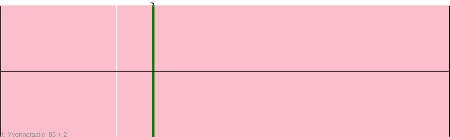
1: Yvonnetastic_85 + 2