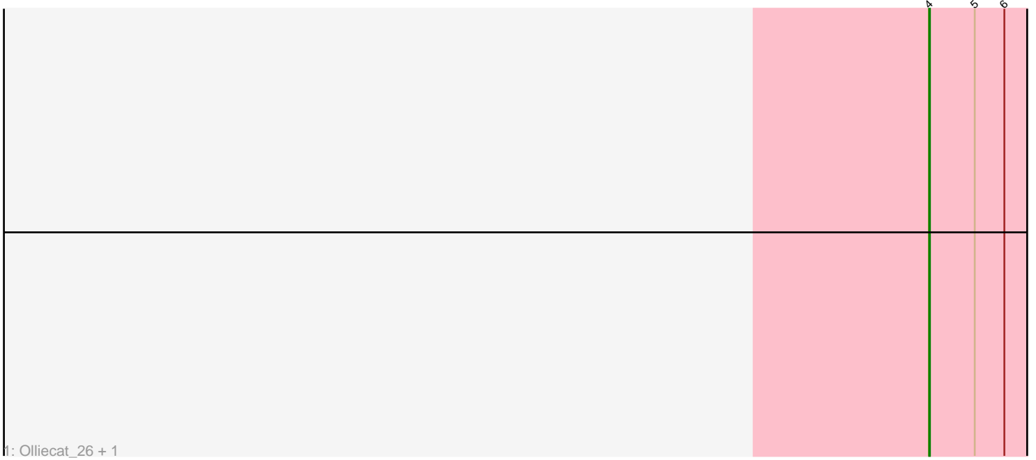
1: Olliecat_26 + 1